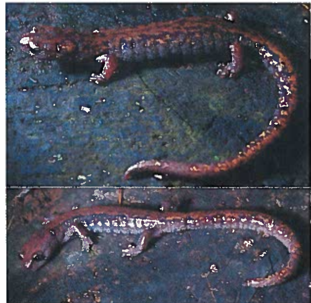
Figure 1. Pseudoeurycea longicauda from the type locality. Photographs by G. Parra-Olea (GP 292–3).

cán and adjacent México (Duellman 1961, Lynch et al. 1983). All known localities are in pine-fir or pine-oak forest. Most of the 64 individuals in the type series were collected beneath the loose bark of large downed pine, fir, and cypress logs, but specimens have also been collected beneath logs, wood chips, and other surface debris. No other salamander species were collected at the type locality, but Duellman (1961) collected P. bellii and Ambystoma ordinarium in sympatry with P. longicauda in pine-fir forest just west of the type locality and at Atzimba National Park, approximately 50 km northwest of the type locality.